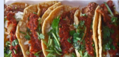
• "Birria" tacos "Jalisco style"