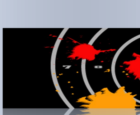
• Paintball gun