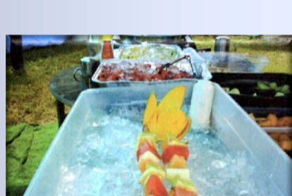
• Fresh Fruit