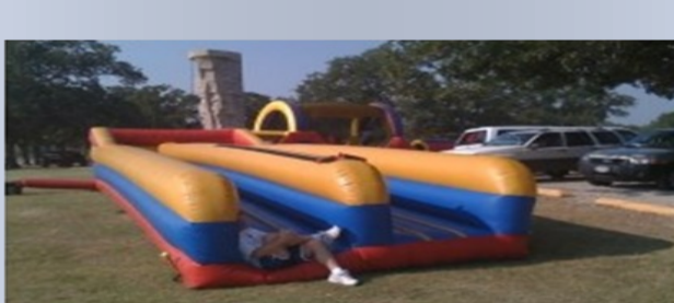
• The Bunge run