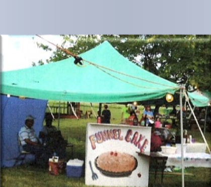
• Funnel cakes