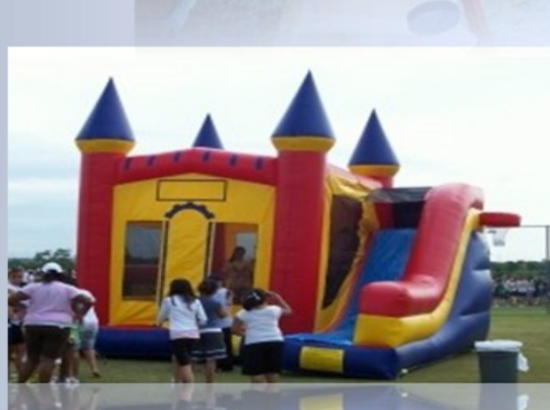
• Mickey mouse bounce house.