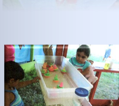
• Duck pond