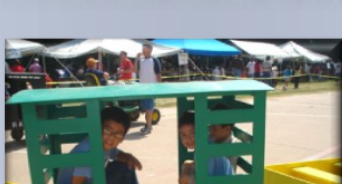
• children's train ride