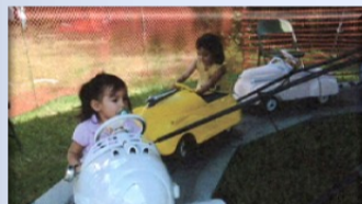
• kiddie cars