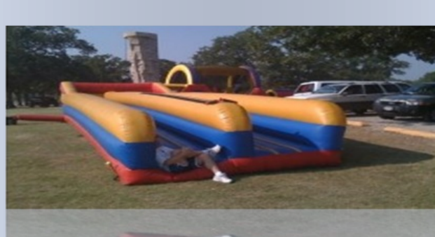
The Bungee run