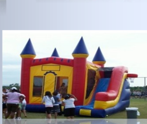
Mickey mouse bounce house.