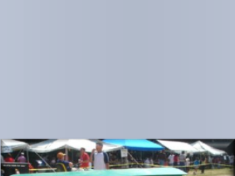
children's train ride