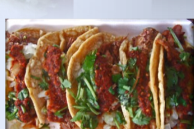
"Birria" tacos "Jalisco style"