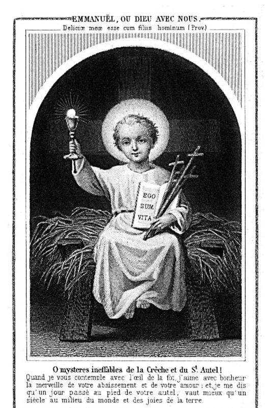
Holy card expressing devotion to the Child Jesus.

"His holiness was so overwhelmingly apparent that at times he inspired sinners to repentance merely by the sight of him."