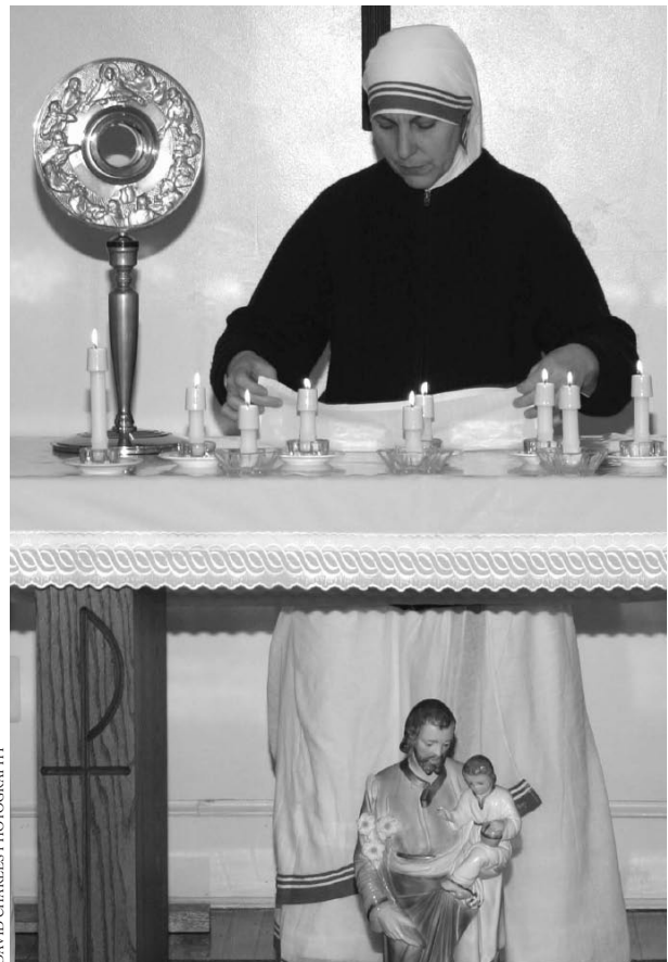
DAVID CHARLES PHOTOGRAPHY