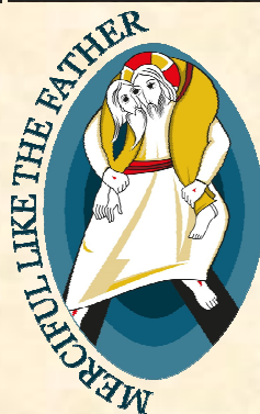
Pope Francis Address, 6-14-14

From the Gospel narratives we are able to understand the closeness, the goodness, the tenderness with which Jesus drew in the suffering people and consoled them, comforted them, and often healed them. By our Teacher's example, we too are called to draw near, to share the conditions of the people we meet.