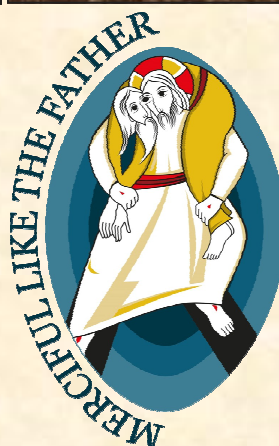
Pope Francis Homily