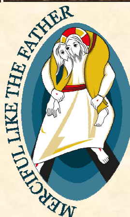
(Vatican Radio) Pope Francis audio-message to the young people of Pompeii.