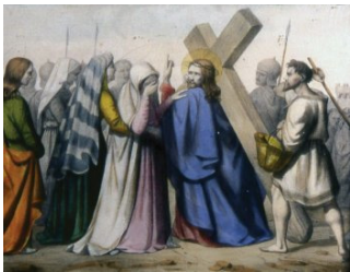
V. Simon of Cyrene Helps Jesus Carry the Cross