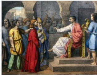
II. Jesus Takes up His Cross