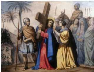
VII. Jesus Falls the Second Time