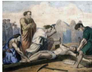
XII. Jesus Dies on the Cross