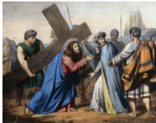
VI. Veronica Wipes the Face of Jesus