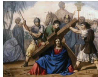
X. Jesus is Stripped of His Garments