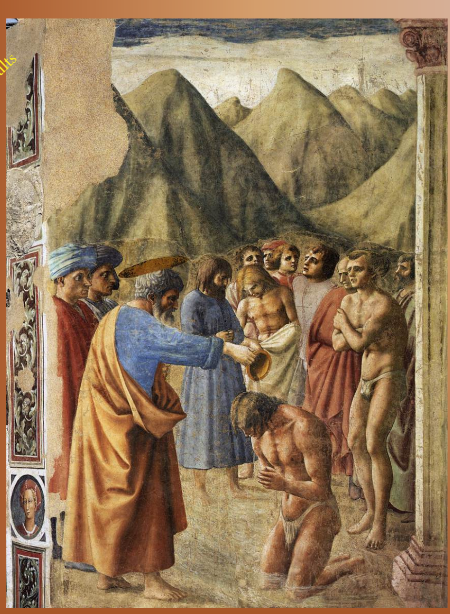
MASACCIO, The Baptism of the Neophytes, 1426-27

If you are interested in learning more about the Catholic Faith or in becoming Catholic, come to the first new RCIA session—