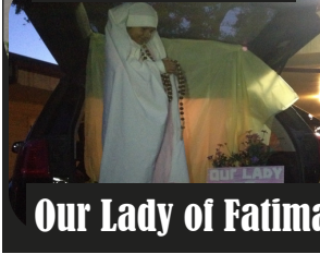
Our Lady of Fatima