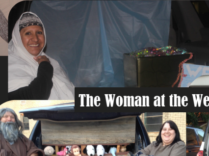
The Woman at the Well