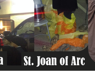
St. Joan of Arc