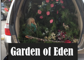
Garden of Eden