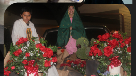
Our Lady of Guadalupe & St. Juan Diego