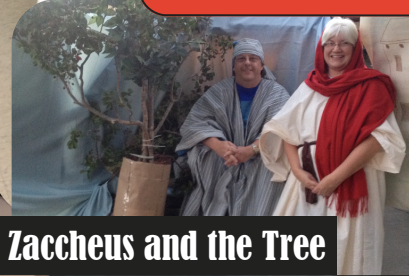
Zaccheus and the Tree