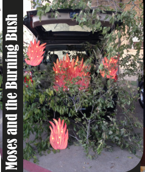
Moses and the Burning Bush