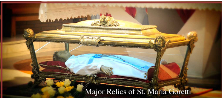
Major Relics of St. Maria Goretti