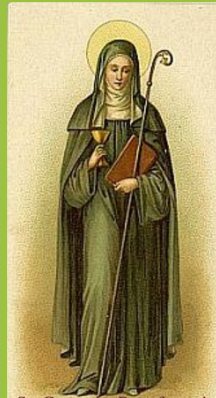
St. Gertrude, Pray for us!