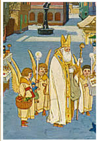
1923 Czech Postcard