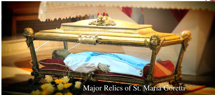
Major Relics of St. Maria Goretti