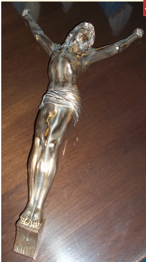
Heavy Bronze Corpus (bottom left)