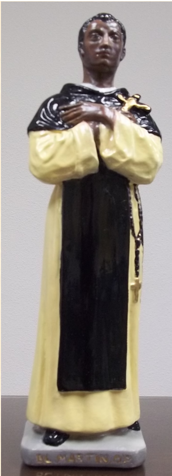
St. Martin de Porres (top left)