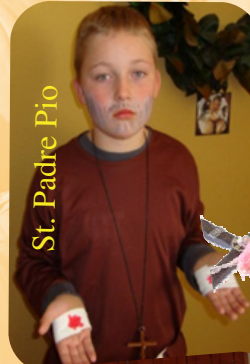
St. Padre Pio

Dress up like a saint or Bible character!