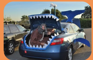
Jonah and the Whale