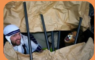
Daniel and the Lion's Den