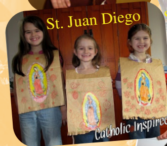
St. Juan Diego