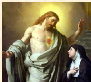
St. Margaret Mary Alacoque Feast day : October 16th

"I need nothing but God, and to lose myself in the heart of Jesus."