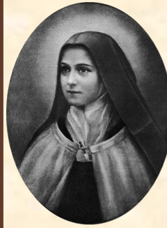
St. Thérèse of Lisieux (1873-1897)