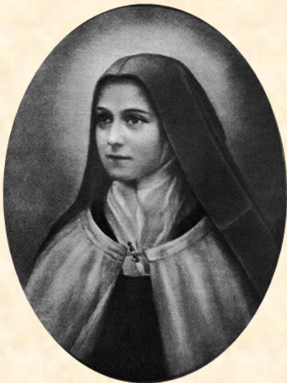
St. Thérèse of Lisieux (1873-1897)

“I prefer the monotony of obscure sacrifice to all ecstasies. To pick up a pin for love can convert a soul.”