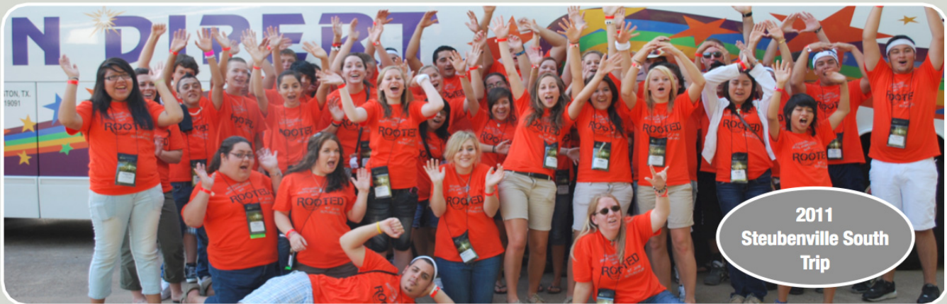
2011 Steubenville South Trip