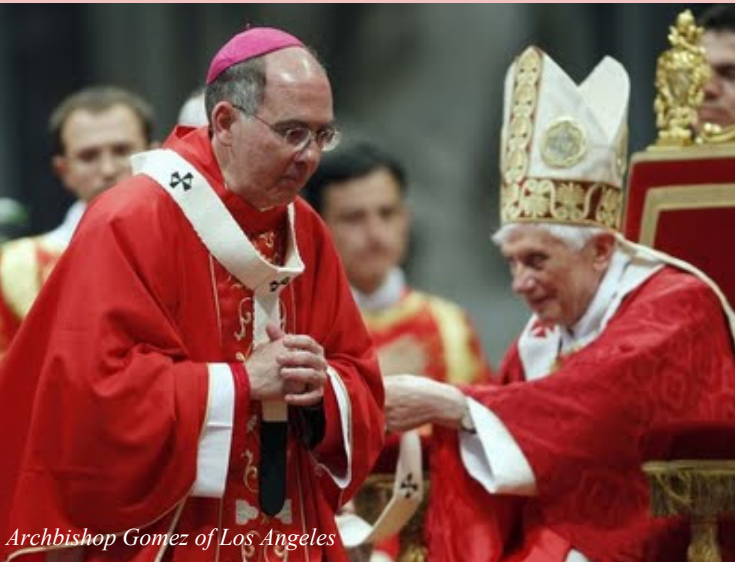
Archbishop Gomez of Los Angeles

Pope Benedict wears one and, each June 29 th , on the Solem-