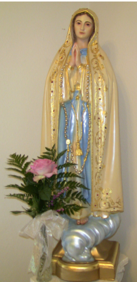
Our Lady of Fatima (left)