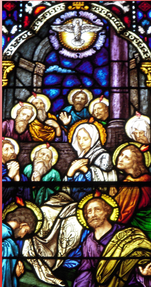
The Holy Spirit descends on the Apostles in the Pentecost window.