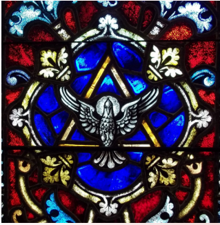
The Holy Spirit in the Triangle, symbolizing the Trinity.