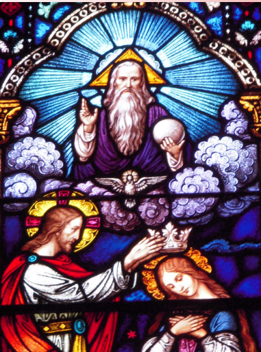
The Holy Spirit in the Coronation of Mary window.