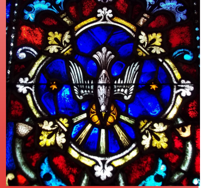
The Holy Spirit showering gifts upon the earth.