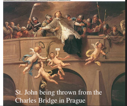
St. John being thrown from the Charles Bridge in Prague