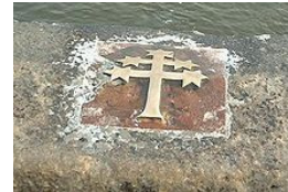
Spot on Charles Bridge from which St. John was thrown into the river

St. John Nepomucene is considered a martyr for the seal of the confessional for having died rather than tell the king what the queen had said in the confessional.