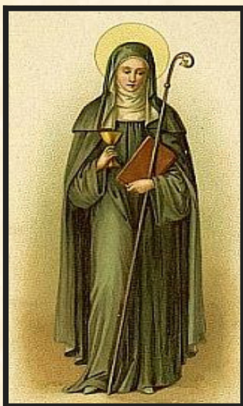
St. Gertrude, Pray for us!

E ternal Father, I offer Thee the Most Precious Blood of Thy Divine Son, Jesus, in union with the Masses said throughout the world today, for all the holy souls in purgatory, for sinners everywhere, for sinners in the universal church, those in my own home and within my family. Amen.