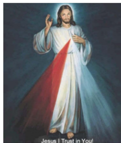
Jesus I Trust in You!