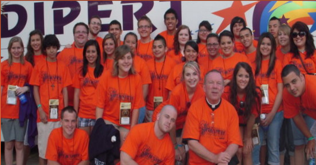
Steubenville South Trip 2010