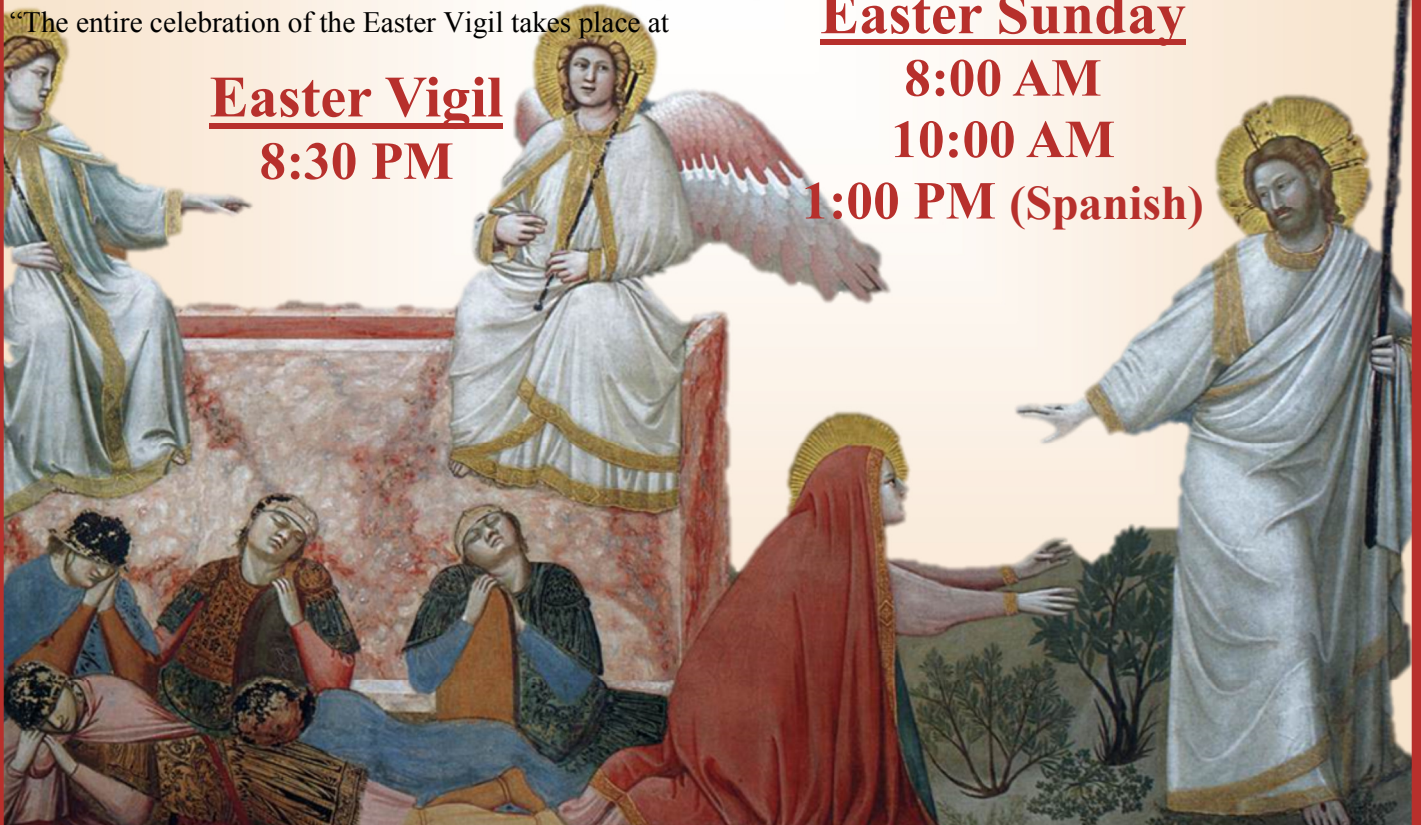
Giotto di Bondone, Resurrection (detail), 1304-1306, Cappella Scrovegni (Arena Chapel), Padua