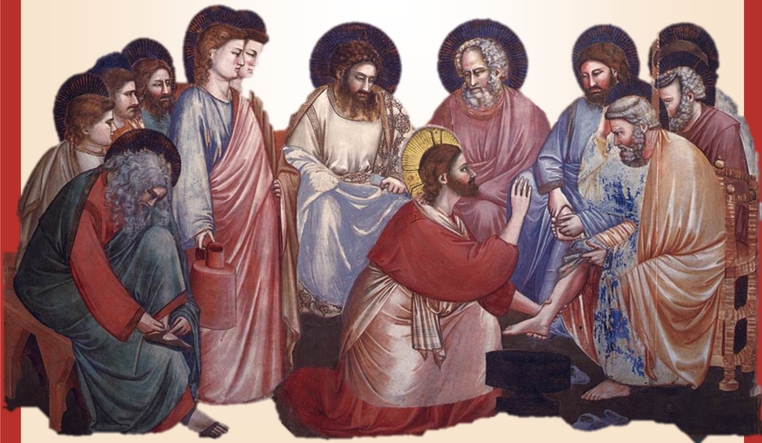
Giotto di Bondone, Washing of Feet (detail), 1304-1306, Cappella Scrovegni (Arena Chapel), Padua