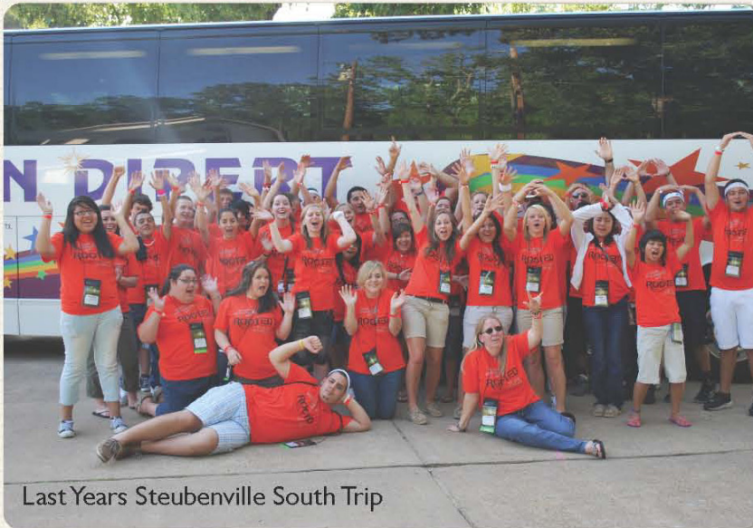
Last Years Steubenville South Trip