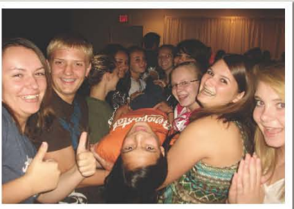
PICTURES FROM DIFFERENT EVENTS THIS YEAR. HOPE YOU JOIN US FOR FUTURE EVENTS!