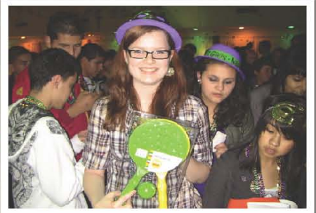
PICTURES FROM LAST YEARS LIFE TEEN MARDI GRAS NIGHT! HOPE YOU JOIN US THIS YEAR!