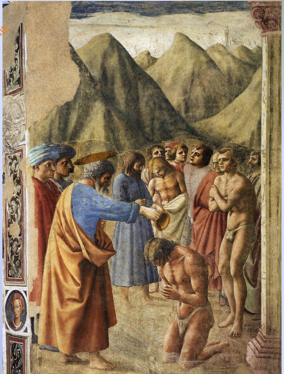
MASACCIO, The Baptism of the Neophytes , 1426-27

If you are interested in learning more about the Catholic Faith or in becoming Catholic, come to the first new RCIA session—