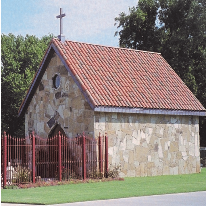
Portiuncula Chapel of St. Francis & St. Clare