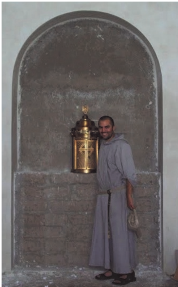
St. Patrick donated Tabernacle in New Friary Chapel