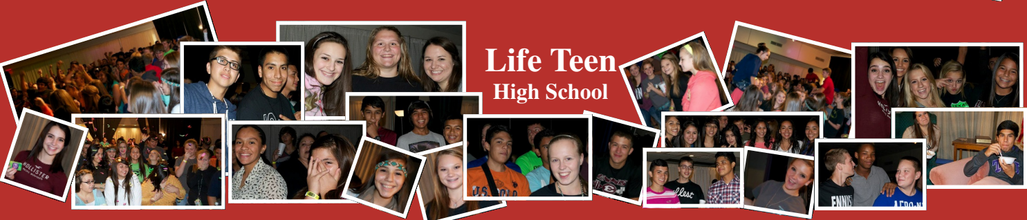
Life Teen High School