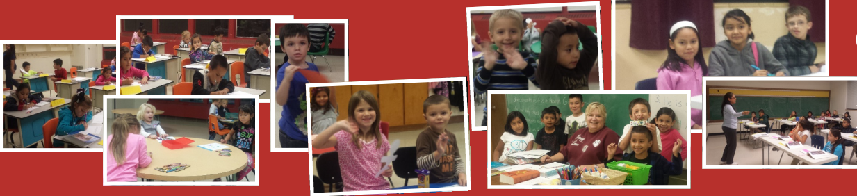
Children's Religious Education PRE K-5